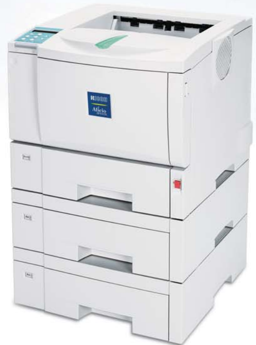
Fully configured Ricoh Aficio AP410N

The compact RICOH® Aficio® AP410/AP410N Series – available in two configurations – offers everything needed to achieve the highest levels of office productivity and efficiency: low cost per page, fast throughput, a large expandable paper supply, flexible paper handling, superb image quality, and intuitive device management utilities. The Aficio AP410 is ideal for budget-conscious business professionals, while the equally affordable network-ready Aficio AP410N serves as a robust, shared network printing resource. The Aficio AP410 and AP410N are true “Best-in-Class” printers from an industry leader – Ricoh.